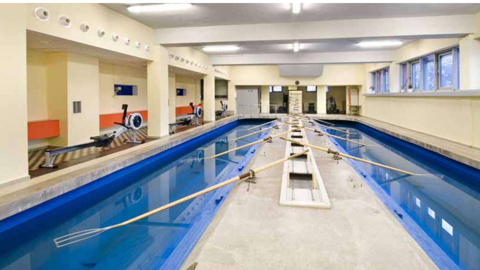
Rowing Gym in the Academic Sport Center of Gdańsk Tech