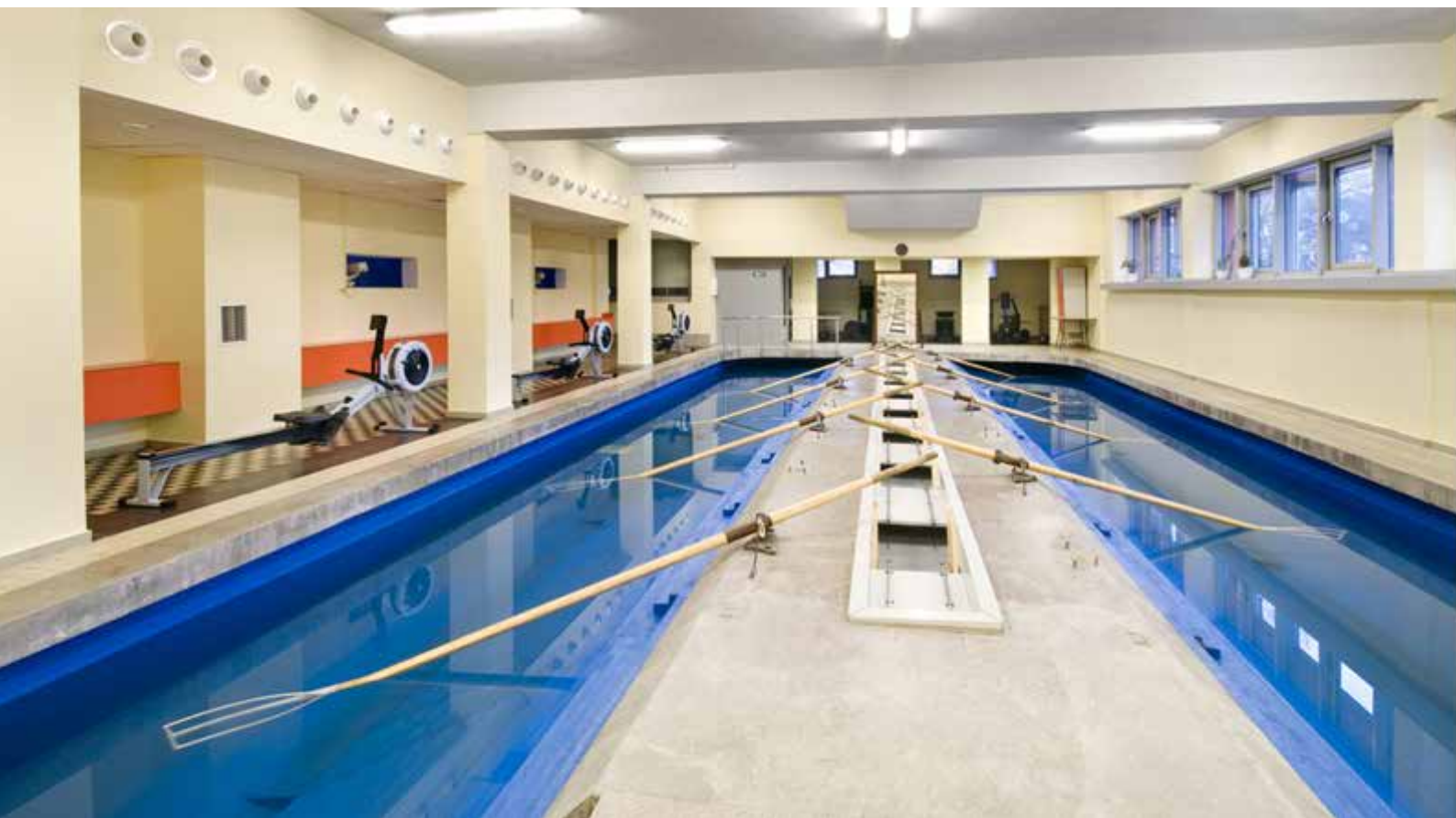
Rowing Gym in the Academic Sport Center of Gdańsk Tech