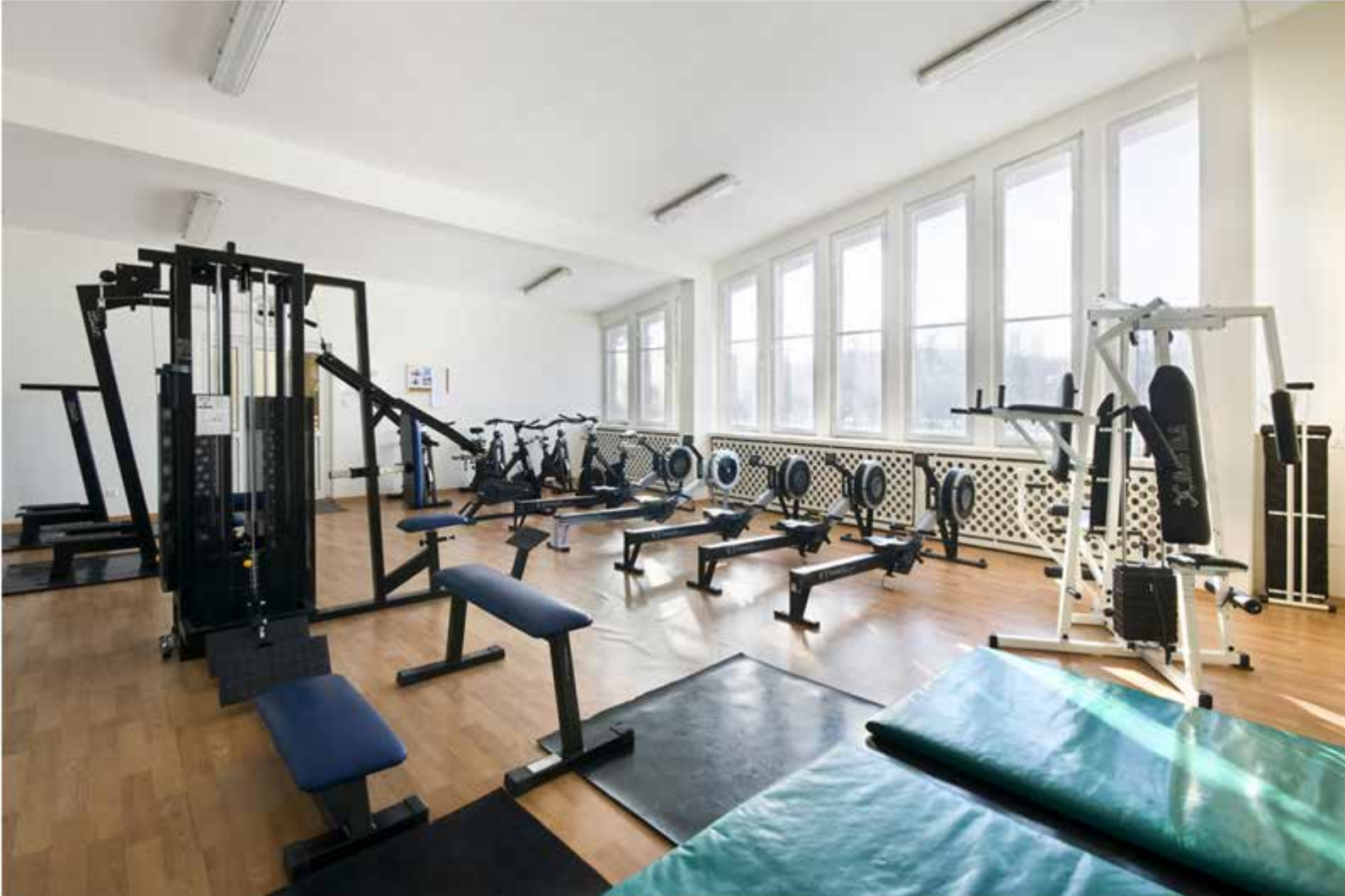
Gym in the Academic Sports Centre of Gdańsk Tech