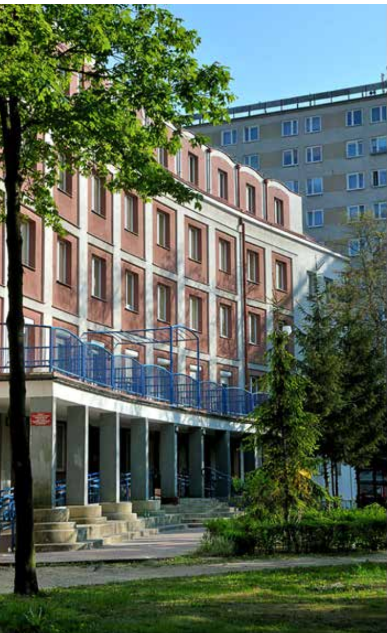
Student Halls of Residence Nos. 4, 5 and 10

A standard is double room comes with bedclothes and a fridge. Residents have access to the internet. Each of the buildings features a kitchen, launderette, study room, TV room, and gym. Most of the halls of residence are accessible for people with physical disabilities.