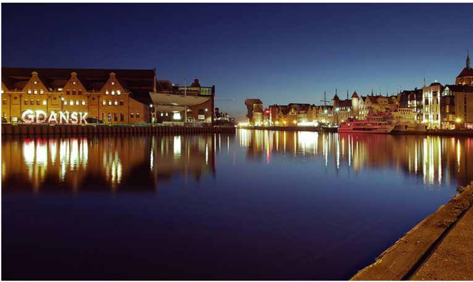
Gdańsk seen from the Motława river side, on the left the Polish Baltic Philharmonic