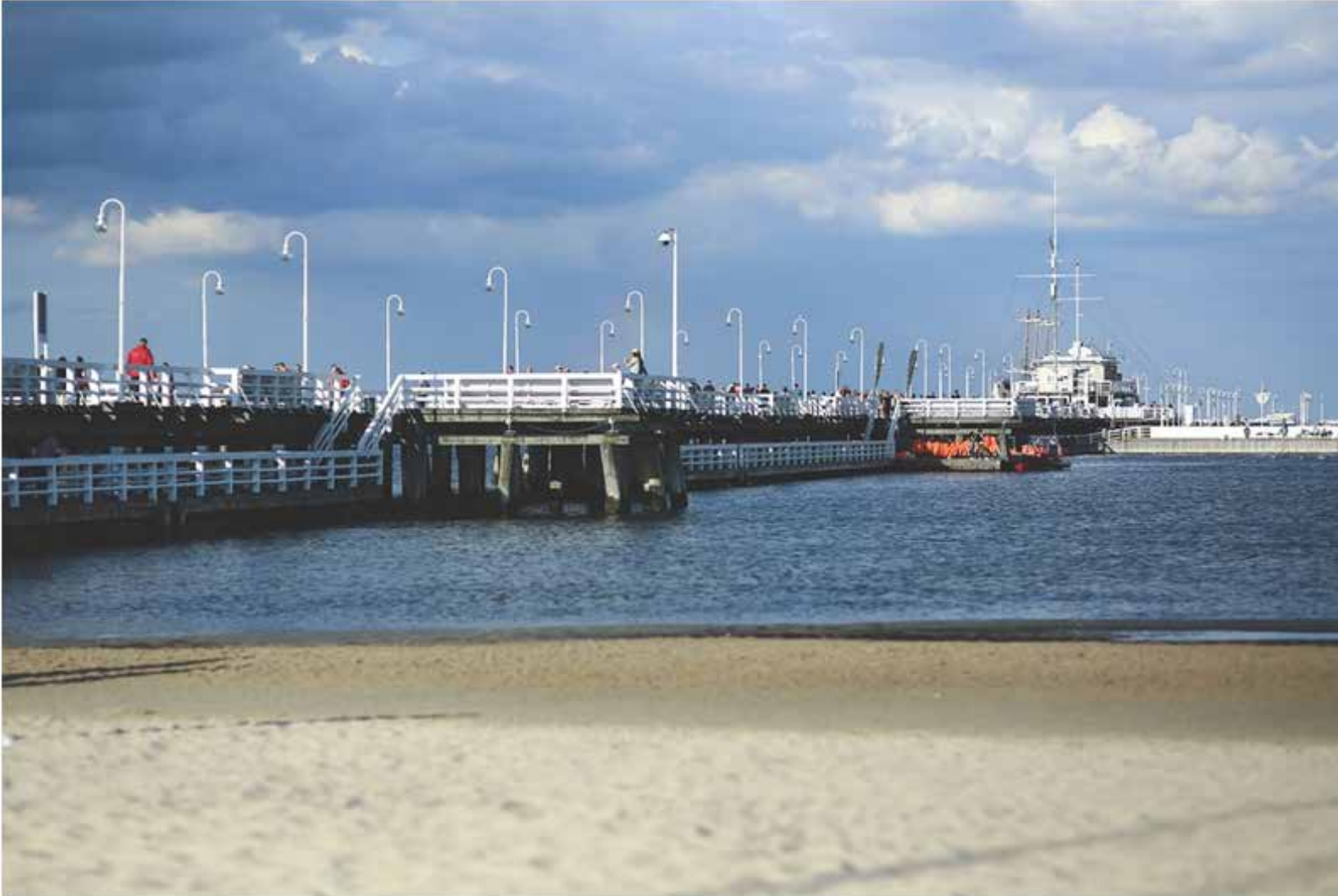
The Sopot Pier, the longest facility of this type at the Baltic Sea